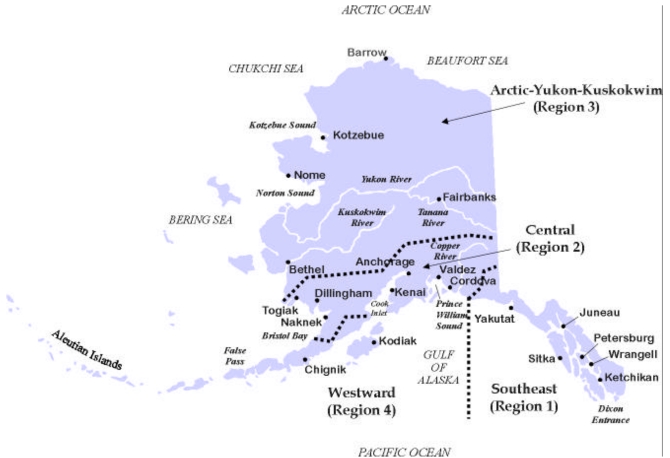
Figure 2. The four fishery management regions (Southeast, Central, Arctic-Yukon-Kuskokwim, and Westward) of the Alaska Department of Fish and Game, Division of Commercial Fisheries.