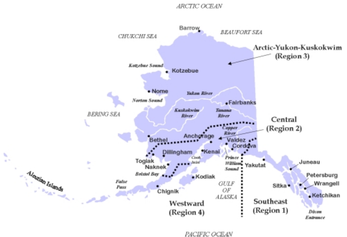
Figure 2. The four fishery management regions (Southeast, Central, Arctic-Yukon-Kuskokwim, and Westward) of the Alaska Department of Fish and Game, Division of Commercial Fisheries.