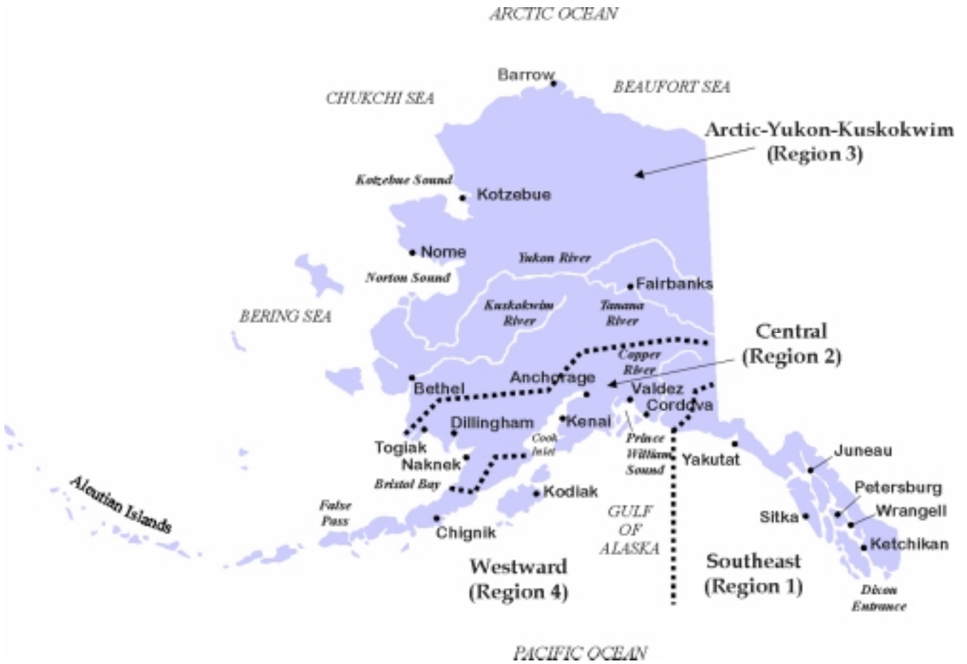
Figure 2. The four fishery management regions (Southeast, Central, Arctic-Yukon-Kuskokwim, and Westward) of the Alaska Department of Fish and Game, Division of Commercial Fisheries.